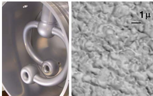
Figure 2. Re-plated SLR and microstructure of deposit produced using the adopted plating procedure

Re-plated SLR and a SEM image of a sample deposit produced using this procedure are shown in figure 2.